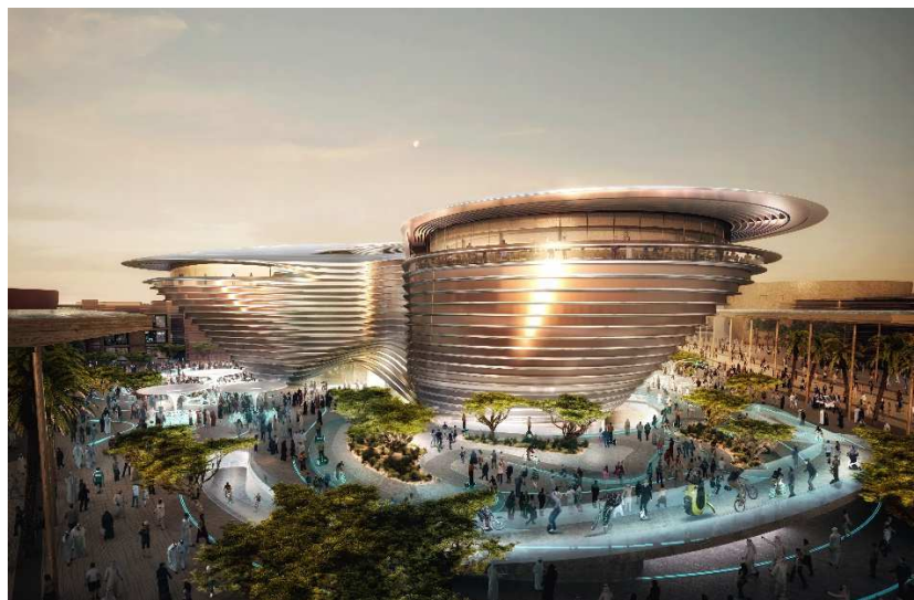
Mobility Pavilion Entrance View

The Expo theme, 'Connecting Minds, Creating the Future', recognises that generating sustainable solutions to global problems demands collaboration across cultures, nations, and regions. Australia's participation will be delivered primarily through the Australian Pavilion, located in the "mobility" sub-theme district, which will feature a high-impact visitor experience. The Pavilion will also host targeted cultural and business programs, as well as other associated events.