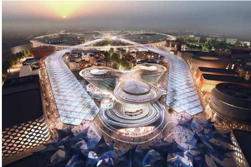
Mobility Pavilion and District

The Expo theme, 'Connecting Minds, Creating the Future', recognises that generating sustainable solutions to global problems demands collaboration across cultures, nations, and regions. Australia's participation will be delivered primarily through the Australian Pavilion, located in the "mobility" sub-theme district, which will feature a high-impact visitor experience. The Pavilion will also host targeted cultural and business programs, as well as other associated events.